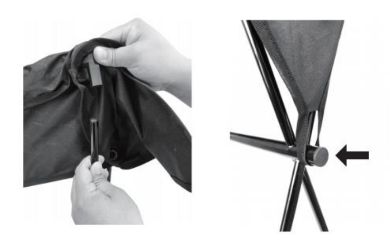
Step 4. 8pcs small hooks need to be assembled on the top of frame and 4pcs for each side to secure the fabric cover with frame. 4pcs big hook need to be assembled at the bottom of pole. 12pcs hooks in total can hang your pots and pans. Please kindly note that the loading weight is 10kg totally.