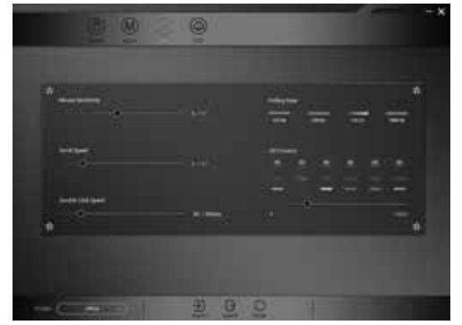
Adjustable 800 ~ 12800 DPI and respective light color. Adjustable 125Hz ~ 1kHz polling rate.