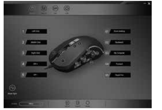
Programmable 10 keys function

Please download the software from the link below: http://www.crest.com.au/43277483