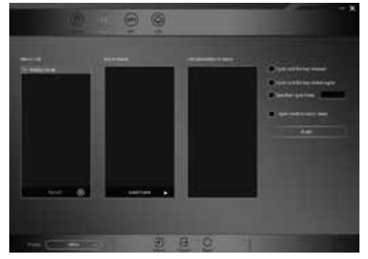
The Marco Program.