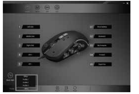
Switch between office mode (default) and gaming mode (profile 1)