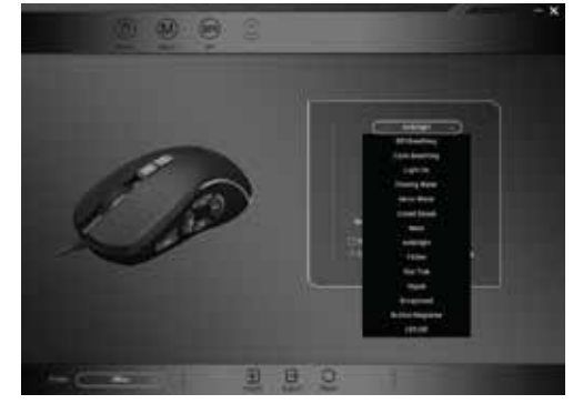
14 light modes including 13 RGB + 1 light off under Office mode.