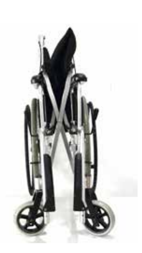
Step 8: The wheel chair will need maintenance when using a period of time to ensure safety.