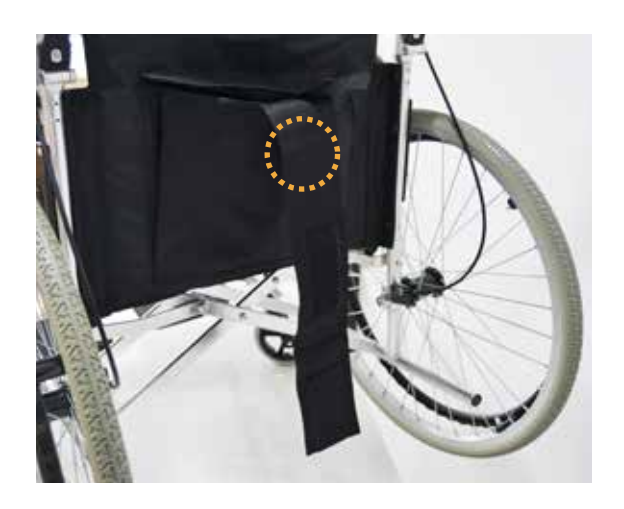
Step 5: Take the belt from the back bag of the chair.