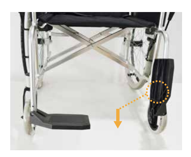
Step 4: Turn down the left and right footrests.