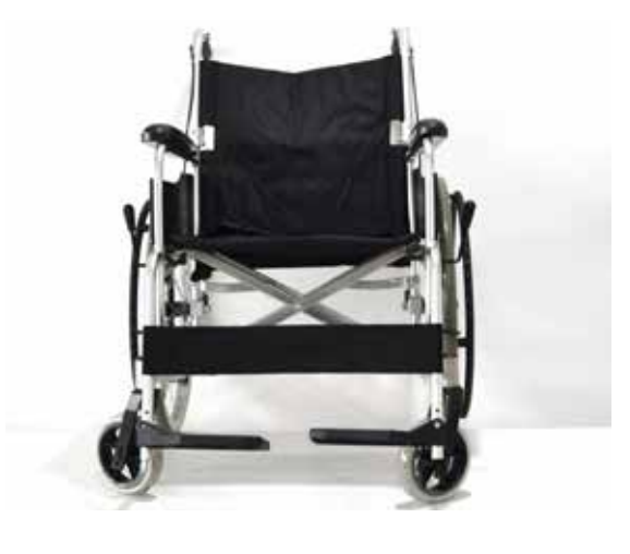
Step 6: Stick the belt to the front of the chair. Now the wheel chair is ready to use.