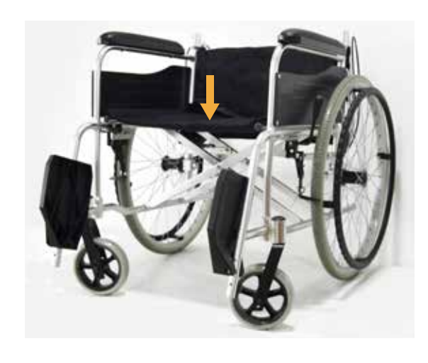
Step 2: To open the chair, face the front of the chair, place hands on seat rails and push down and out, the seat will open.