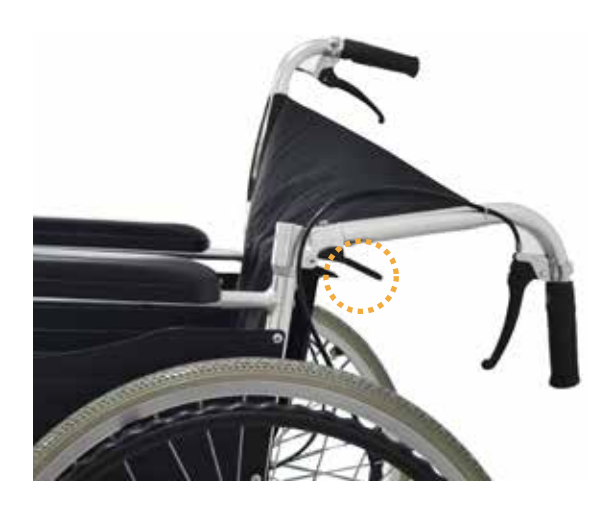
Step 3: Lift back support to upright position. The lock will engage automatically.