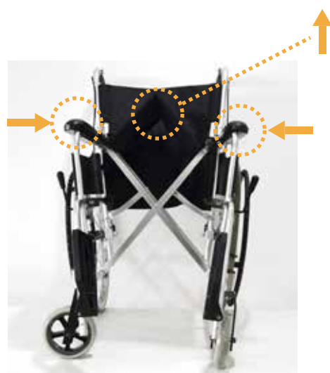
Step 7: When you don't want to use the chair, you can fold down and store, pull up on locks simulaneously and carefully fold down the back support.