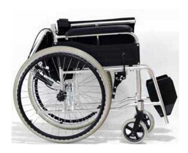
Step 1: How the wheel chair looks when taken from the carton.