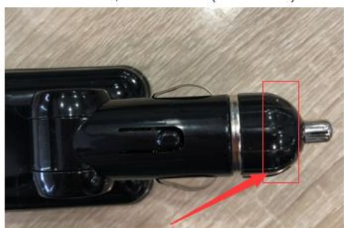
Unscrew here to replace the fuse

In case of fuse damage and need to replace. Unscrew the bottom end of the cigarette plug. Replace with fuse 1A 250V 5x20mm, (not included).