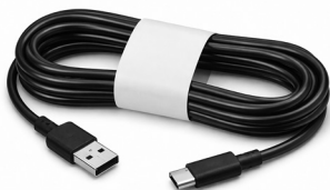
USB type C charging cable