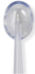
TONGUE CLEANER TIP

With 3 thin tufts of bristles, this tip helps to remove plaque around hard-to-reach areas.