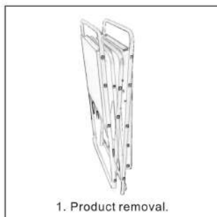
1. Product removal.