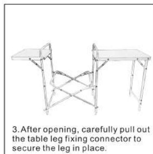
3. After opening, carefully pull out the table leg fixing connector to secure the leg in place.