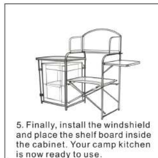
5. Finally, install the windshield and place the shelf board inside the cabinet. Your camp kitchen is now ready to use.

Spot clean with mild soapy water, allow fabric to dry naturally & wipe surfaces dry. Do not use bleach, acids, solvents or abrasive cleaners. Store in a cool, dry place when not in use.