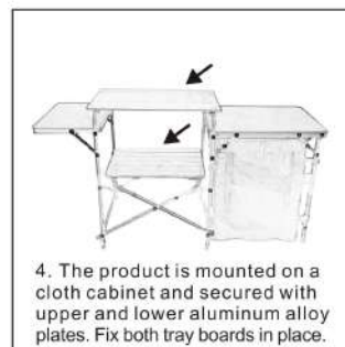
4. The product is mounted on a cloth cabinet and secured with upper and lower aluminum alloy plates. Fix both tray boards in place.

THIS PRODUCT IS FOR OUTDOOR CAMPING USE ONLY TO BE ASSEMBLED BY AN ADULT & USED UNDER ADULT SUPERVISION.