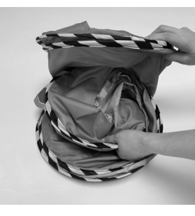
7. Form 3 circles.