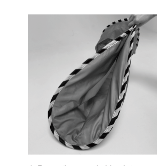
4. Press the round sides into a