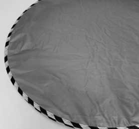
and flatten down the pit.