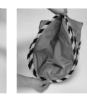
5. Twist the item around and into