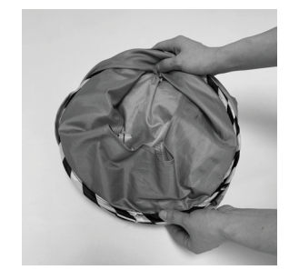
9. Fold into 3 even overlapping circles. You may tie a cord around the product to keep it together. Place inside its original box and keep in a safe place away from children.