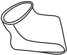
Foot warmer body

Place the foot warmer flat on the floor and ensure it is not wrinkled. Then place the sherpa cover into the foot warmer to keep it clean.