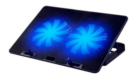
Keycode: 43026623 Laptop Stand with Cooling Fans

Thank you for choosing Laptop Cooling Stand. To ensure optimum performance and safety, please read these instructions carefully before operating this product.