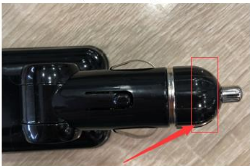
Unscrew here to replace the fuse

In case of fuse damage and need to replace. Unscrew the bottom end of the cigarette plug. Replace with fuse 1A 250V 5x20mm, (not included).